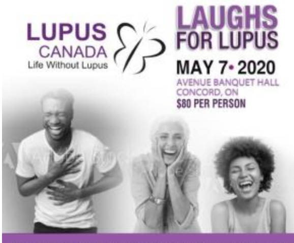
IN SUPPORT OF THE THOUSANDS OF CANADIANS LIVING WITH LUPUS

Help us move the dial forward and make a difference in the lives of Canadians living with lupus!